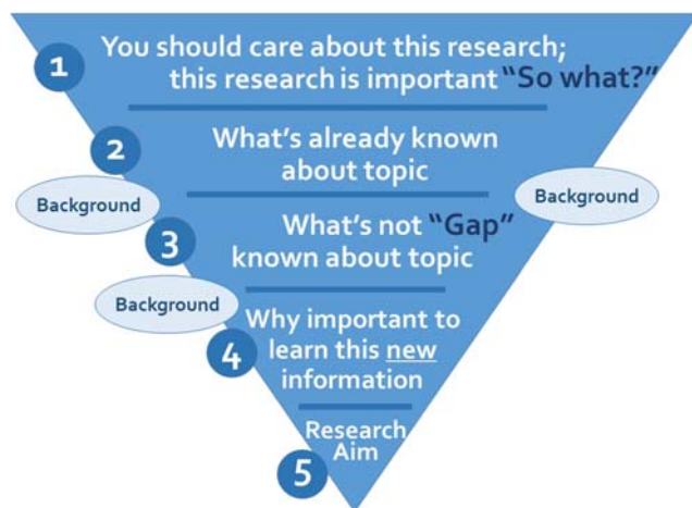
Fig. 1 The main elements of the introduction section of an original research article. Often, the elements overlap

errors in communication, we also suggest outlining more detailed roles, such as who will draft each section of the manuscript, write the abstract, submit the paper electronically, serve as corresponding author, and write the cover letter. It is best to formalize this agreement in writing after discussing it, circulating the document to the author team for approval. We suggest creating a title page on which all authors are listed in the agreed-upon order. It may be necessary to adjust authorship roles and order during the development of the paper. If a new author order is agreed upon, be sure to update the title page in the manuscript draft.